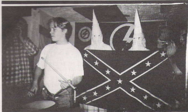
The Klan fly the flag