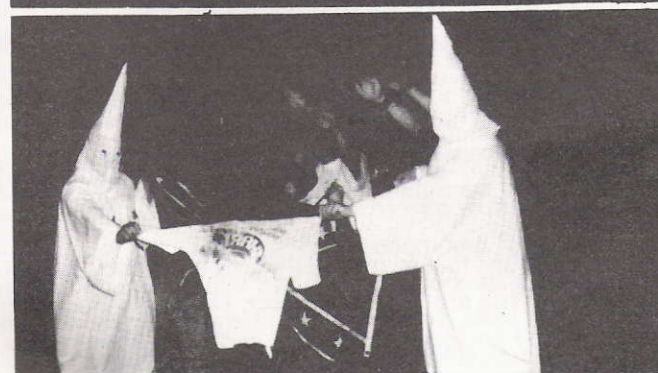
Ulster B&H torch S.H.A.R.P.