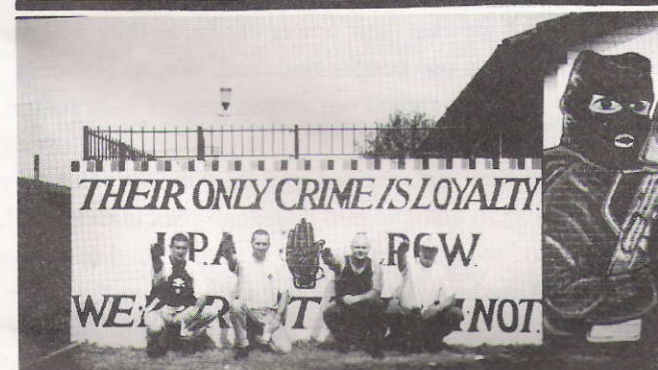
Celtic Warrior hail the Red Hand