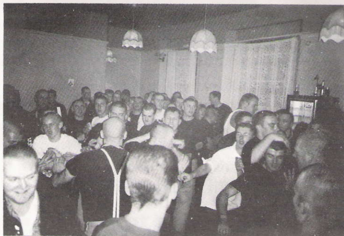
The crowd go mad