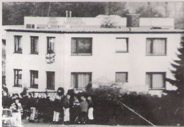
THORSTEN HEISS'S HOME IN NORTHEIM, SITE OF THE CONCERT

On the day of the gig, three halls were cancelled as a game of cat and mouse with Z.O.G. took place. Security was tight and everything that could be done was done to find a hall but to no avail. In the end, Thorsten decided to stage the gig in the car park of his home, thinking that the police couldn't interfere as it is private property. At first the police were taken by surprise at the sheer number of N.S. in attendance as between 1200 - 1500 were assembled outside the house and there would have been more but 300 were kept at the local train station along with seven coaches turned back. Local police estimated that over 2500 people tried to get to the gig in all. Not having enough police to stop the gig at this stage, they thought they would be clever and stopped the P.A. gear being delivered. This left everyone standing in freezing weather for